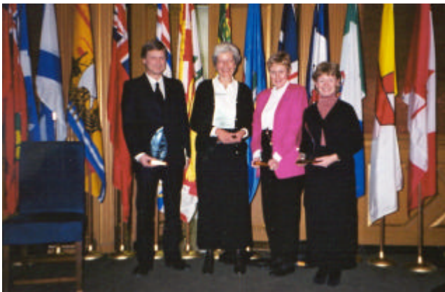
Library Staff Vancouver Justice Canada

staff. Prior to the creation of the gateway via the Library's home page, access to the library's databases, CD-ROMs and on-line commercial research tools was scattered. With the advent of the gateway approach to the Library's many databases and electronic research tools, legal research has been centralized in one place on the desktop. Staff can access the research resources by either approaching the resources from a general list or by practice group (i.e. Criminal law). Staff can also bookmark the Library's home page and with one "click" have access to the necessary research resources at their fingertips. This results in an increased savings to the staff of the B.C. Region both in terms of time and money. Since the inception of the gateway approach in November 2000, the Library's home page has had over 25,000 hits. This means that the Library's web page is reaching around 95 hits a day.